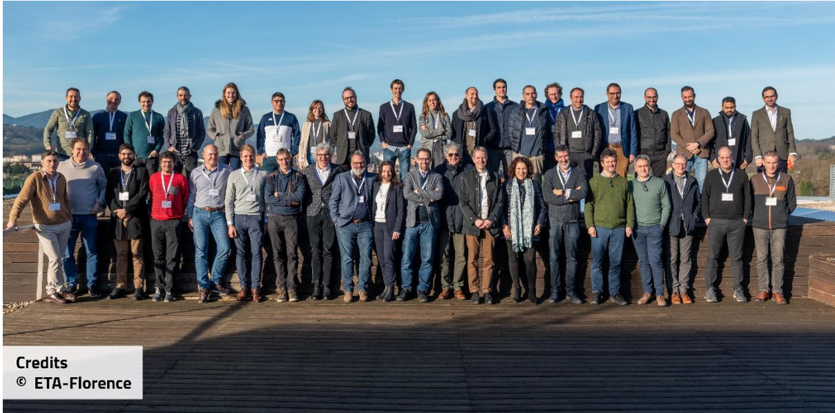
SEAMLESS-PV partners during the Bilbao meeting

The consortium is composed by reference research institutes and industrial players, covering key roles along the IPV value chain of various sectors, including equipment manufacturers, IPV product manufacturers and end users in each sector, among others: Mondragon Assembly, Becquerel Institute, PIZ srl, ETA Florence - renewable energies, ONYX Solar, SONO Motors, CEA, BECSA, BRANKA solutions, Format D2, AKUO Energy, Optimal Computing, Padanaplast SRL, CASA S.P.A., SUPSI, 3S Swiss Solar Solutions AG and CSEM.